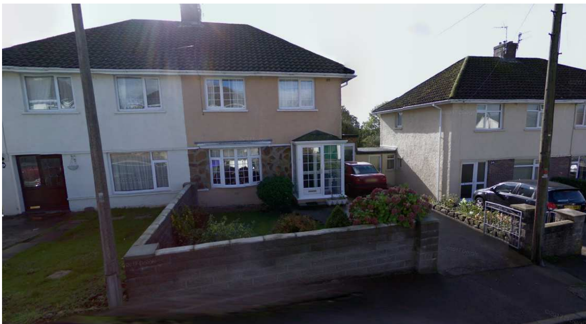
Streetscene View of 26 Heol y Mynydd

The site itself comprises a semi-detached, two storey property which faces north. The dwelling is positioned forward of the centre of the residential plot of around 300 square metres, adjacent to the eastern boundary of the application site and 28 Heol y Mynydd. The land slopes gently from east to west.